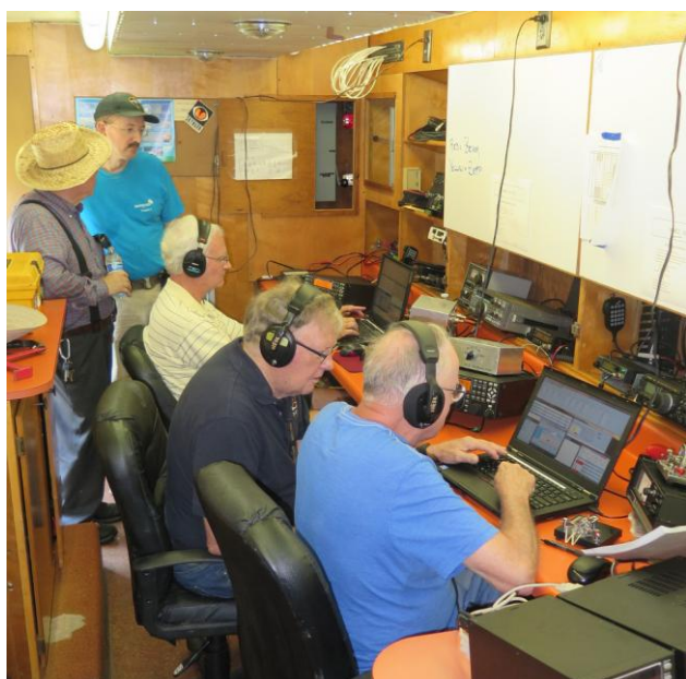
CW in the MCU with KV4ZR, KA2WDL, N1LN, KX4GP, N8BR, Picture: KK4BPH