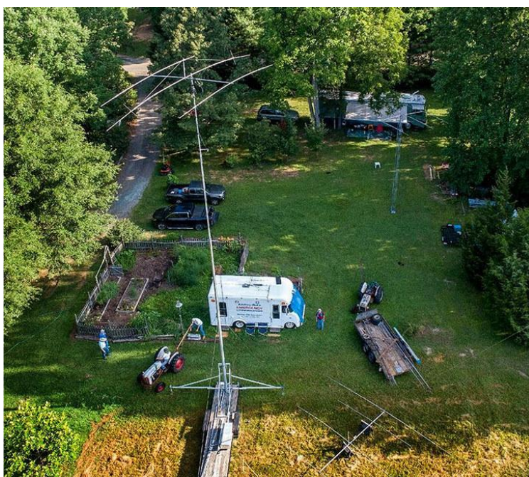
Two towers up – antenna ready for Saturday morning

This will be a quick synopsis of our operation this year a more detailed report will be given for the August Link. As usual, we had successes and